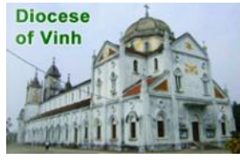
Diocese of Vinh